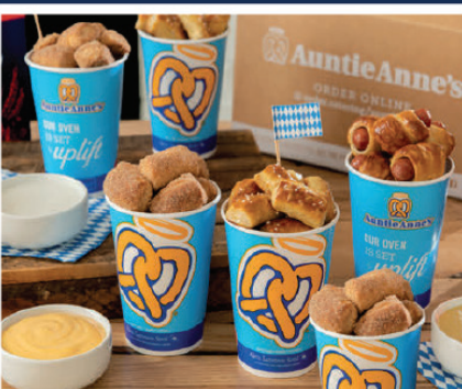
Six cups of Nuggets & Mini Dogs