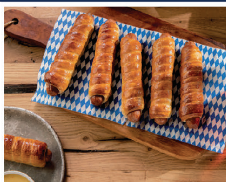
Six Pretzel Dogs